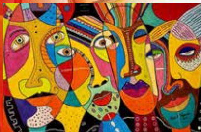
Juror's Choice Grace Haggard Untitled , mixed media